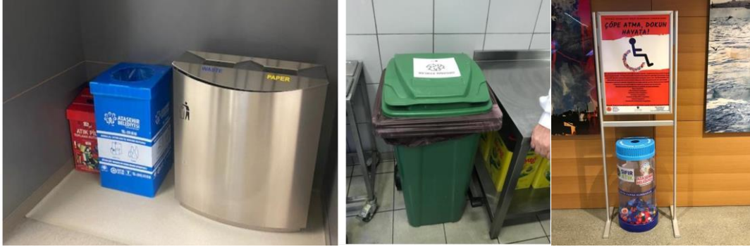
Figure 10. Sample recycling bins on campus for waste, paper, plastics, battery and organic wastes.