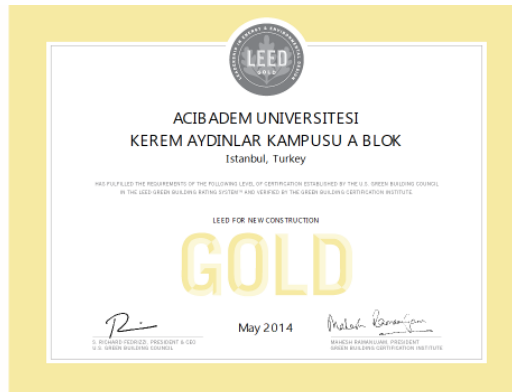
Figure 6. Leed Gold Certificate.