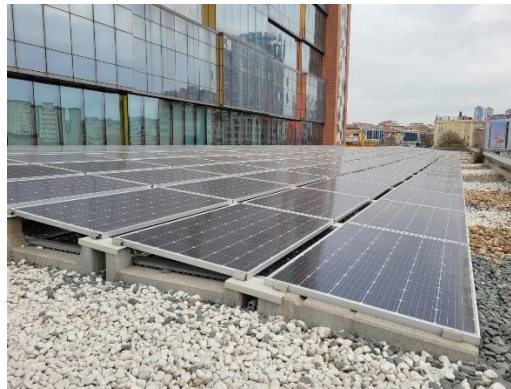
Figure 5. Solar panels on the roof top.