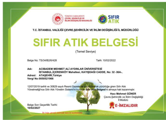
Figure 11. Zero waste certificate.