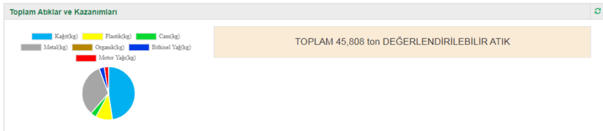
Figure 14. Acibadem University's total recyclable waste and its composition recorded in the Zero Waste Management System since 2019.