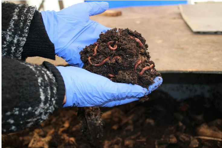
Figure 12. Tea-coffee waste compost processing.