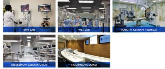
Figure 2. CASE infrastructure.