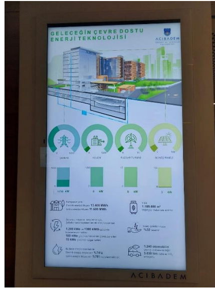
Figure 4. Daily energy production follow-up panels shared in real-time at the campus.