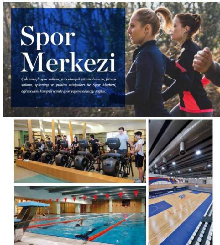
Figure 1. Sports facilities on campus.

The Sports Center uses a membership system. Membership is discounted for University employees and students.