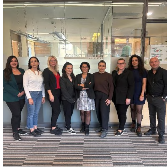
Student Affairs Team